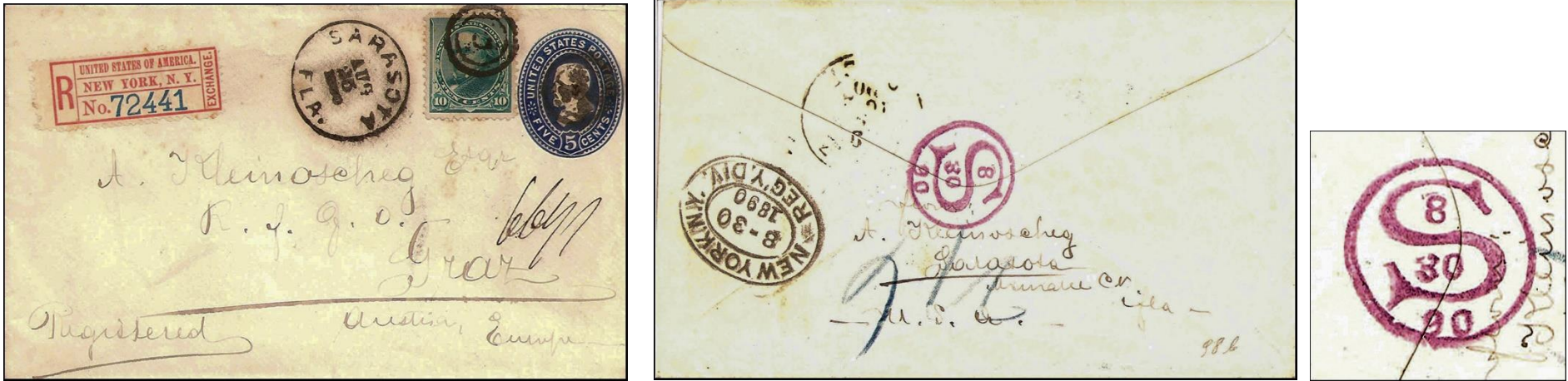
Figure 21. SARASOTA FLA. 08.25.1890, with New York Label 72441, and on reverse examiner's handstamp S.