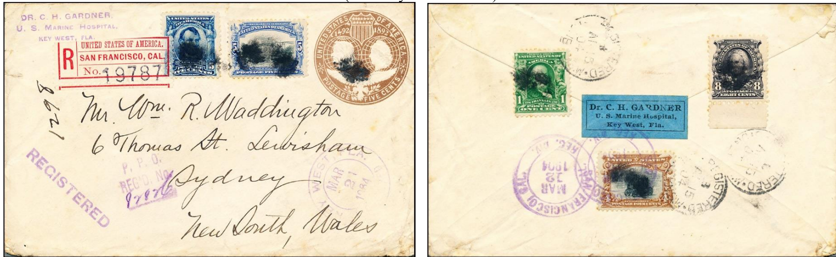
Figure 12. KEY WEST FLA CDS, 03.12.1904, with San Francisco Cal. Exchange Label 19787.