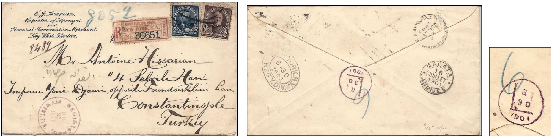
Figure 10. Key West Registered CDS, 06.25.1901 with New York Label 36651, on reverse examiner's handstamp L.