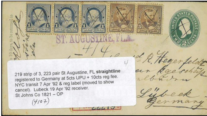
Figure 23 & 24. ST. AUGUSTINE FLA 04.07.1892 with NY Label 22275