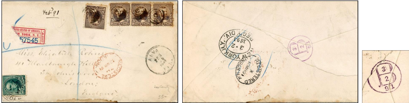
Figure 1. Alva Fla. 02.21.1891, with New York Label 57545, on reverse examiner's handstamp B.