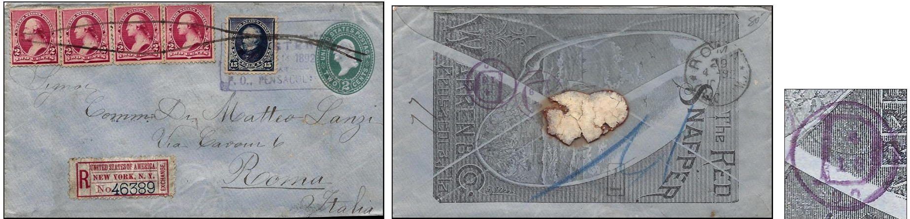
Figure 15. P. O. Pensacola Fla. 04.14.1892, with New York Label 46389 and on reverse examiner's handstamp D.