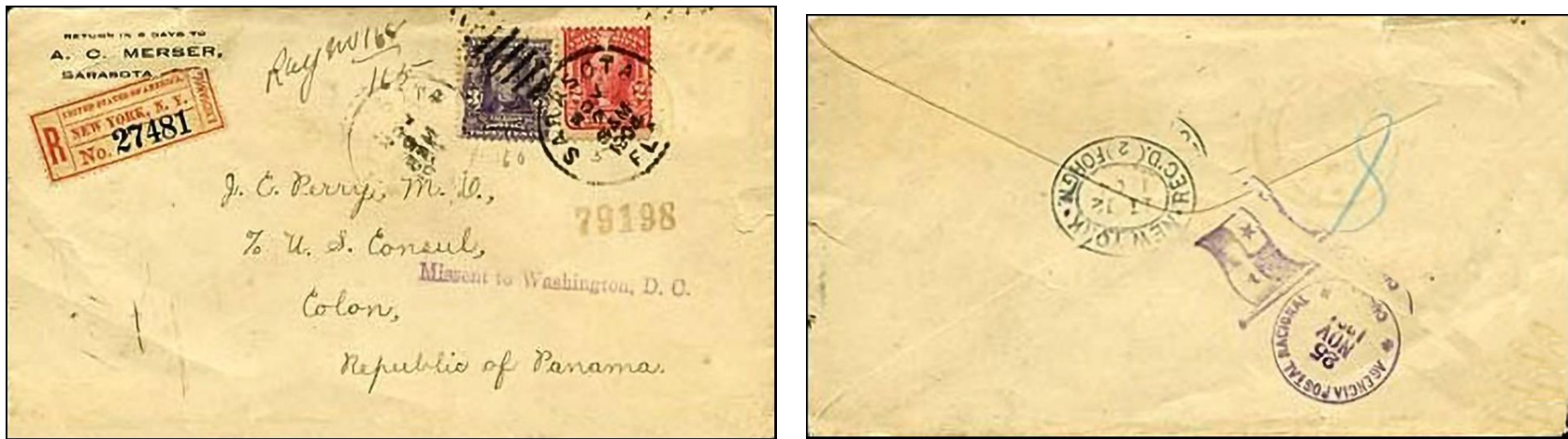
Figure 22. SARASOTA FLA. 11.12.1904, with New York Label 27481.