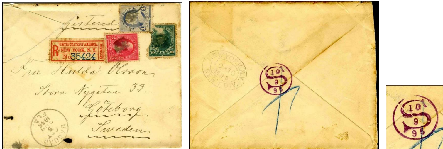
Figure 2. Bagdad Fla. 10.05.1895, with New York Label 35424, on reverse examiner's handstamp S.