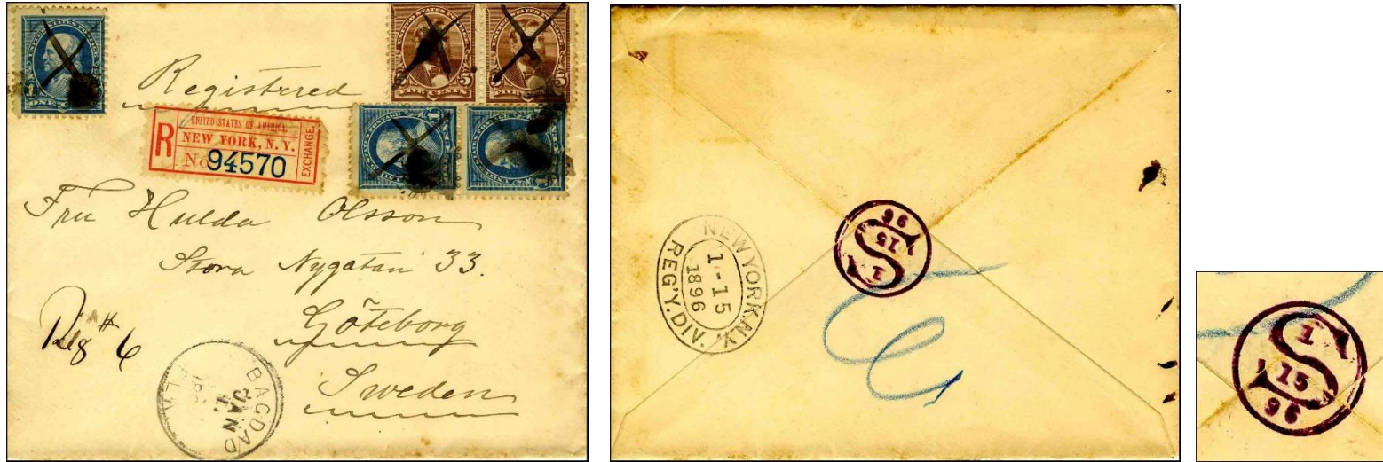
Figure 3. Bagdad Fla., 01.xx.1896 , with New York Label 94570, on reverse examiner's handstamp S.