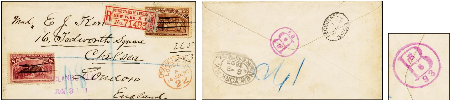
Figure 13. ORLANDO FLA. 06.03.1893, with New York Label 71482, on reverse examiner's handstamp B.