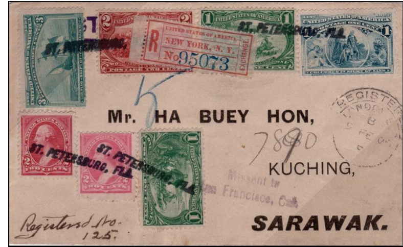
Figure 25. ST. PETERSBURG FLA. 02.01.1905 with New York Label 95073.