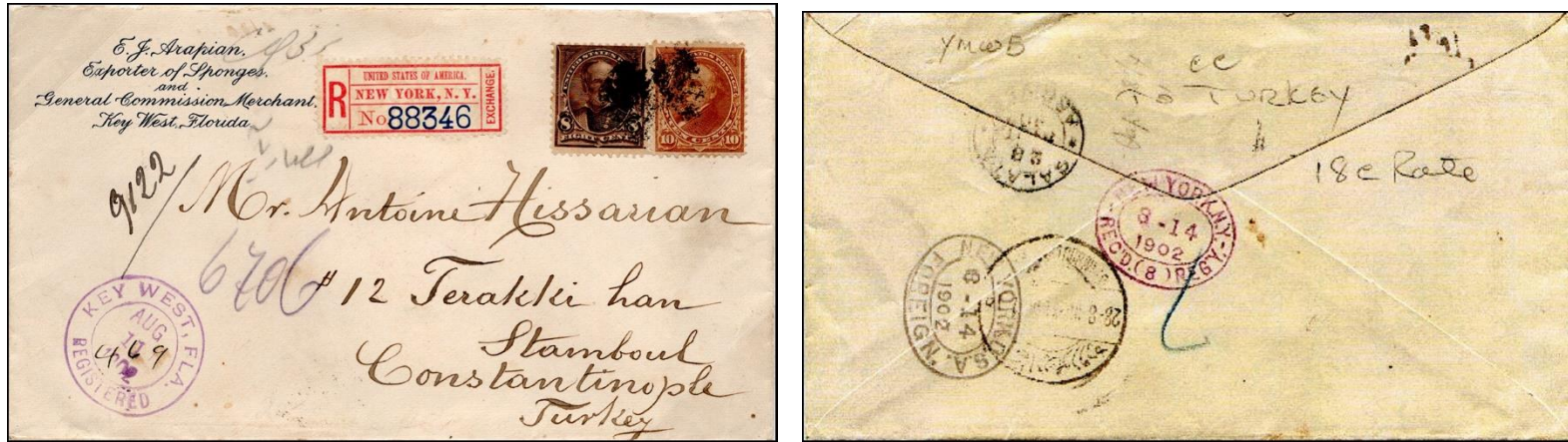
Figure 11. Key West Registered CDS, 08.11.1902 with New York Label 88346.