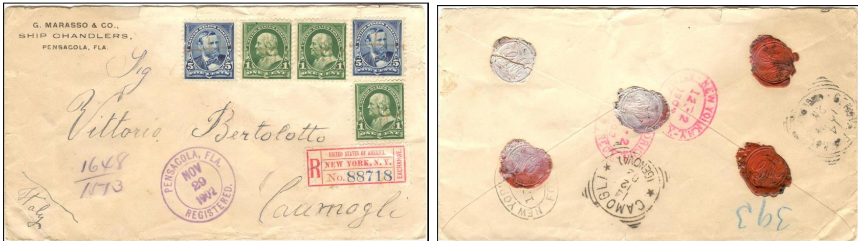
Figure 14. PENSACOLA FLA. 11.29.1902 with New York Label 88718.