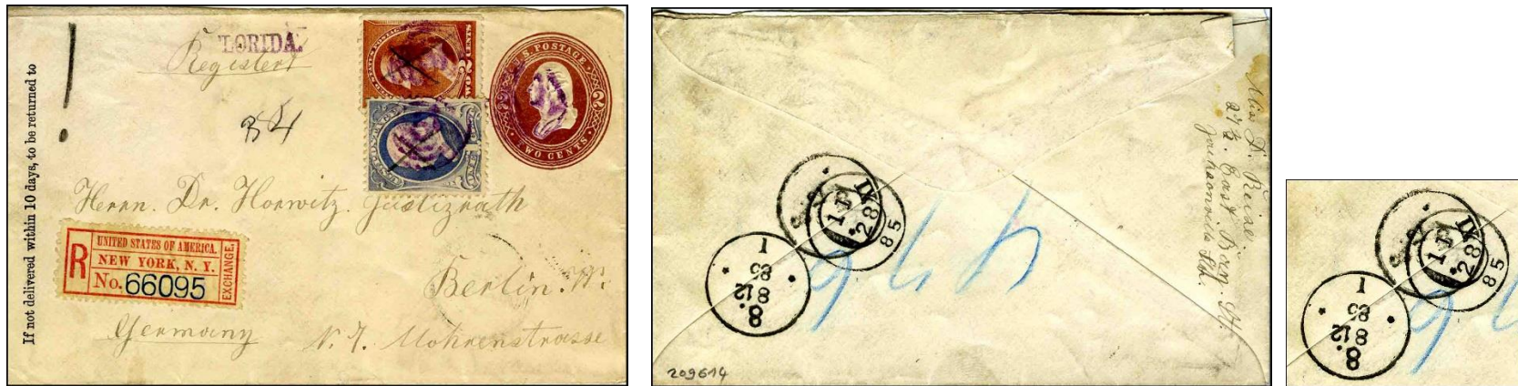
Figure 6. Jacksonville Florida 11.xx.1885, with New York Label 66095 and on reverse examiner's handstamp C.