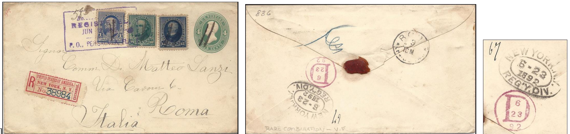
Figure 16. P.O. PENSACOLA FLA. 06.18.1892 with New York Label 38984, on reverse examiner's handstamp D.