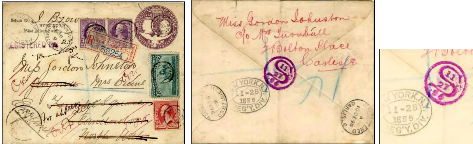
Figure 5. Hypoluxo Fla., 11.21.1895, with New York Label 38254, on reverse examiner's handstamp S.