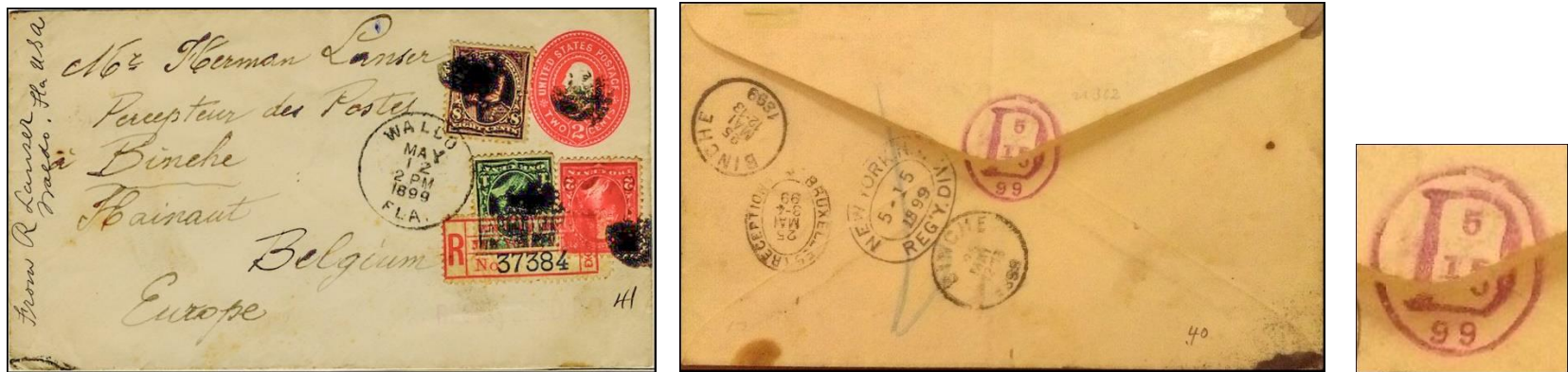
Figure 27. WALDO FLA. 05.12.1899 with New York Label 37384, and on reverse examiner's handstamp D.