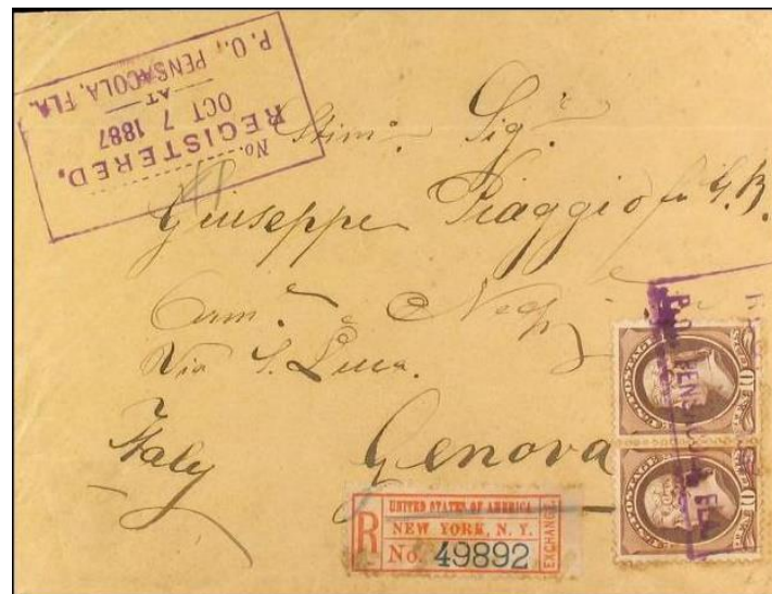
Figure 18. P.O. PENSACOLA FLA 10.07.1887 with New York Label 49892.