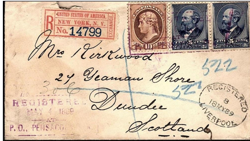
Figure 19. P.O. PENSACOLA FLA. 05.04.1889 with New York Label 14799.