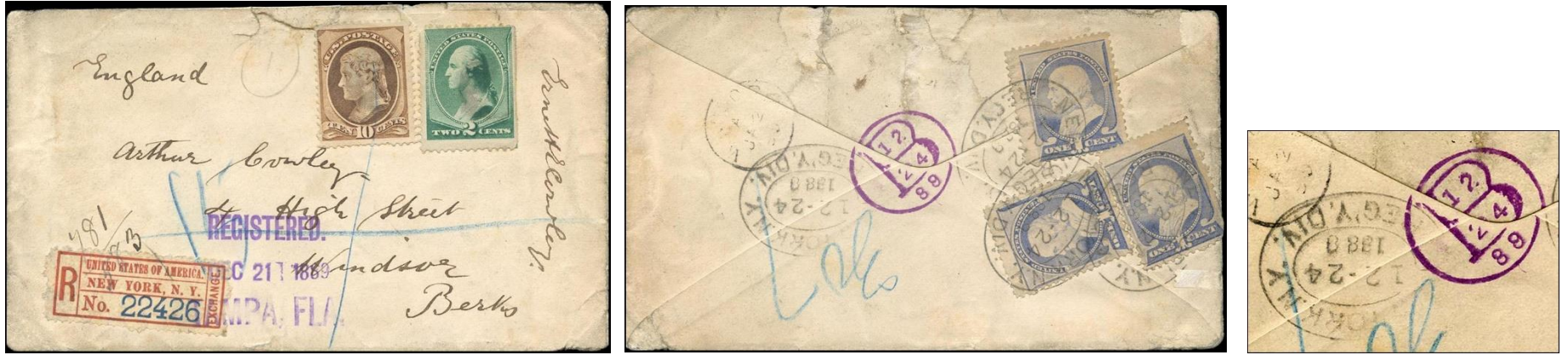
Figure 26. TAMPA FLA. 12.21.1889 with New York Label 22426, and on reverse examiner's handstamp B.