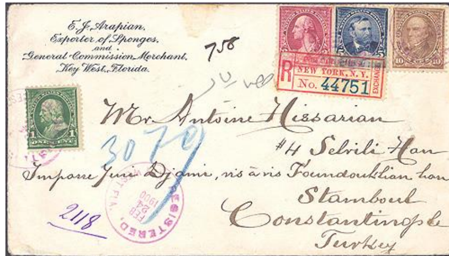
Figure 8. Key West Registered CDS, 02.24.1900, with New York Label 44751.